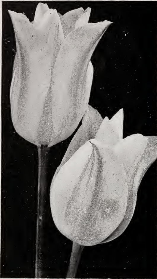
Cottage Tulip, Moonlight.